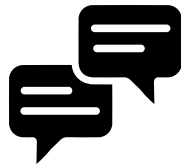
Target Audience #2 Communication & Marketing teams