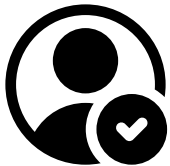
Target Audience #1 Member Facilities