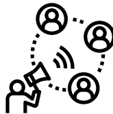
Target Audience #3 Current curlers